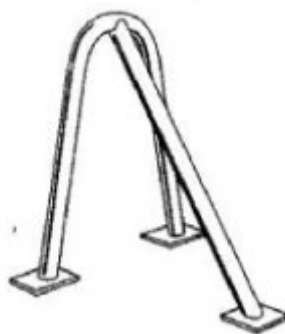
Type 1: Solo Roll Bar