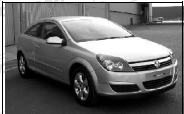
A) Vehicle seen from 3/4 front