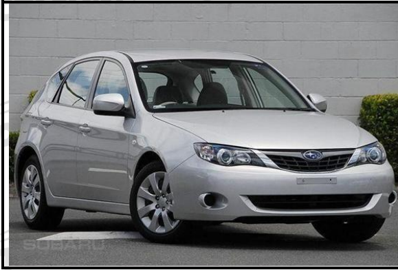
A) Vehicle seen from 3/4 front