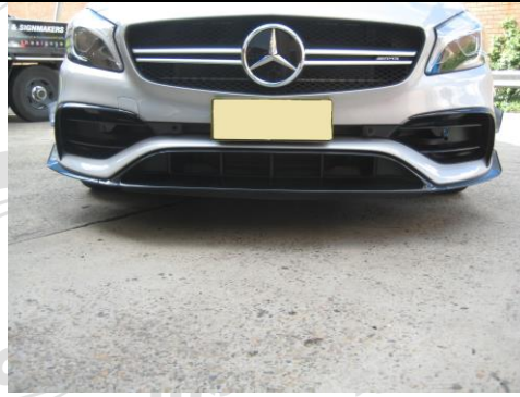
Front Bumper / Splitter