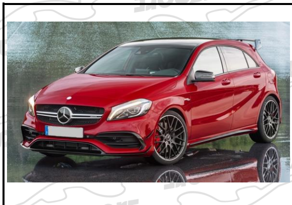
A) Vehicle seen from 3/4 front