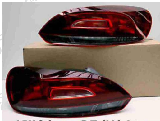
VW Scirocco R Tail Lights