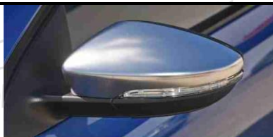
VW Scirocco R External Rear View Mirror