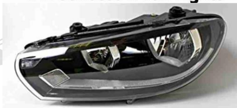
VW Scirocco R Headlight