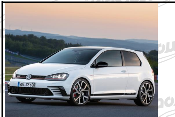
A) Vehicle seen from 3/4 front