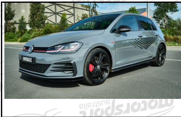
A) Vehicle seen from 3/4 front