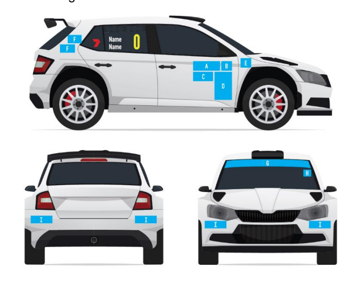
Diagram 1, shown on right (not to scale)