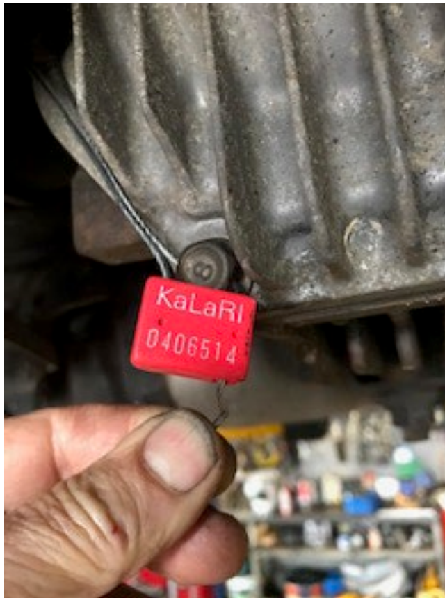
Bolts to be drilled for Diff seal