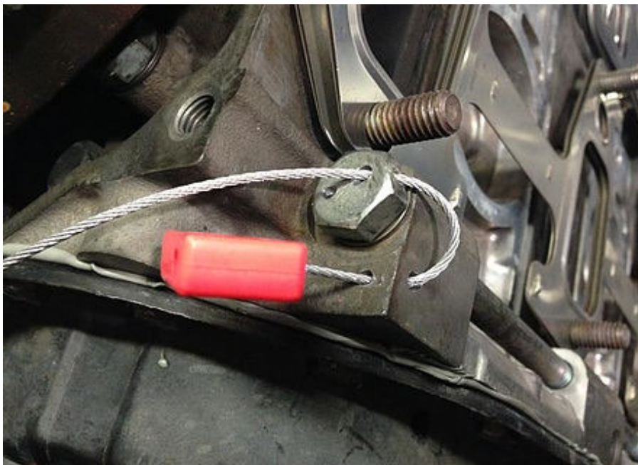
Holes to be drilled for engine seal