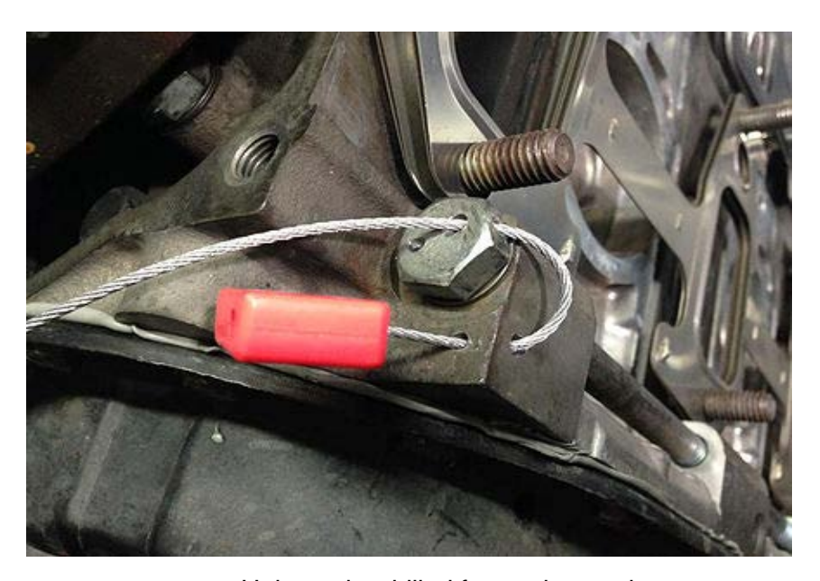
Holes to be drilled for engine seal

(iv) Pictures of where the holes are to be pre-drilled for the seals to be installed.