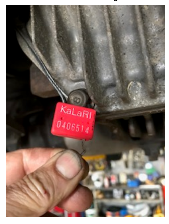
Bolts to be drilled for Diff seal