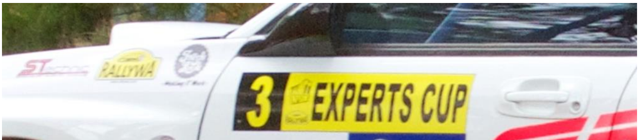
Correct orientation of header sticker for doorplate, car number at front of vehicle