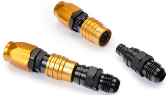
Example of dry break fittings.