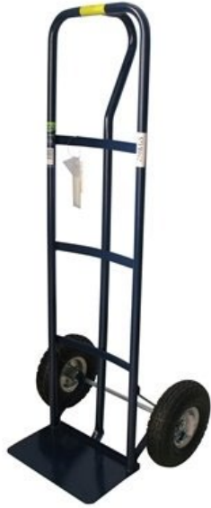
Example of a suitable trolley