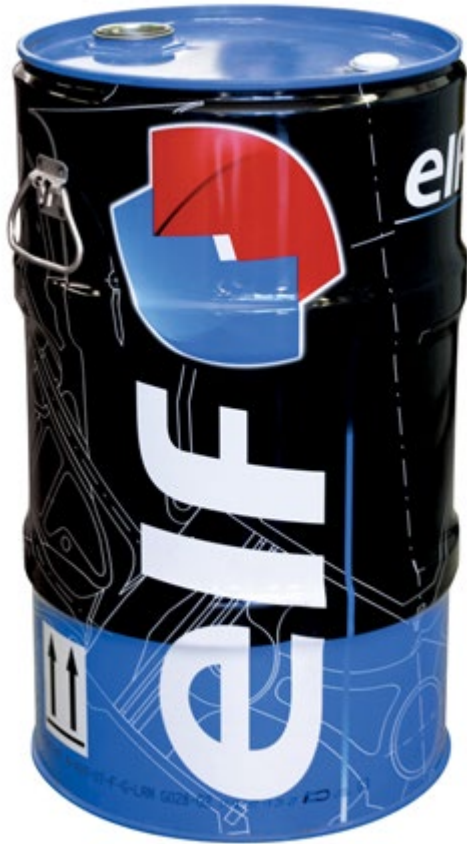
Example of a 60 litre fuel drum