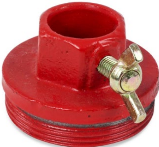
Example of a Steel Drum Pump Clamp