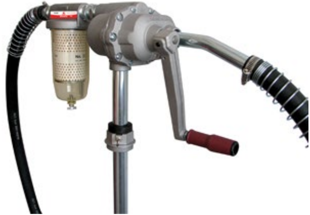
Example of a Rotary drum pump