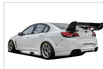
3/4 SIDE VIEW - REAR