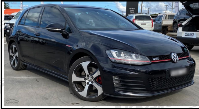
A) Vehicle seen from 3/4 front