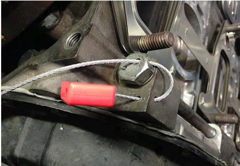
Holes to be drilled for engine seal