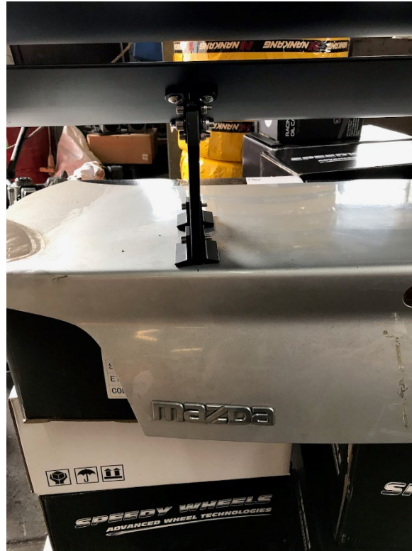
Rear Wing Placement