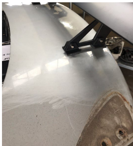
Rear Wing Placement