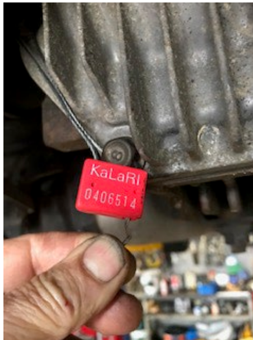
Bolts to be drilled for Diff seal